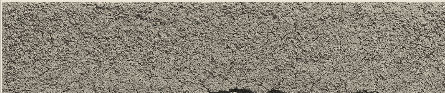
PLATE 02 - THE WOUND. CRACKED-SOIL SPECIMEN, AUSTRALIAN RANGELAND, AUTUMN 2024.