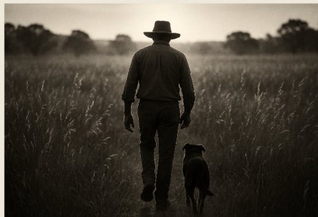
PLATE 10 - THE FARMER. HILLVIEW PARK, NSW SOUTHERN TABLELANDS, APRIL 2026.

1,167 hectares · NSW Southern Tablelands · April 2026.