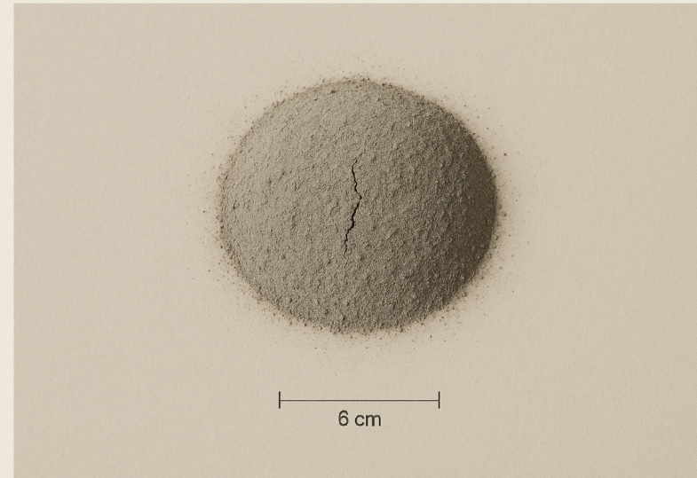
PLATE 02 · FIG. II · THE COUNTER-SPECIMEN · 6 CM SCALE · PAIRED WITH PLATE 01

ABS, Soil and Land Snapshot 2022 — five-year mean across 31 surveyed catchments. Index notation: 1950 baseline = 100 (% of 1950 SOC stock). Forward-looking — indicative only. Wholesale investors only (Corporations Act s708(8)/(11)). Capital is at risk; past performance is not indicative of future results (RG 170). Read the Information Memorandum.