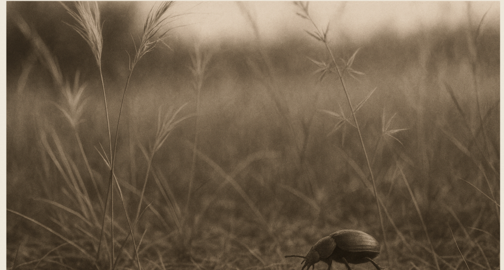
PLATE 09 · FIG. IX · NATIVE PASTURE · OBSERVED GROUND · THE TRUST SPECIMEN

Verbatim from a 38-minute conversation, March 2026. Names withheld pending publication. Forward-looking — indicative only. Wholesale investors only (Corporations Act s708(8)/(11)). Capital is at risk; past performance is not indicative of future results (RG 170). Read the Information Memorandum.