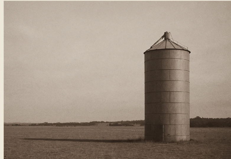
PLATE 11 · FIG. XI · SILO · SKY · THE COMPLIANCE OBJECT

† Wholesale and professional investors only as defined in s708(8)/(11) of the Corporations Act 2001 (Cth). Land Tokens are NOT being issued in this raise — the instrument is equity in Fresh Earth Universe Pty Ltd. Capital is at risk; past performance is not indicative of future results. Forward-looking statements are subject to assumptions disclosed in the Information Memorandum and depend on factors outside Fresh Earth's control (RG 170). Read the IM and the Subscription Agreement before deciding.