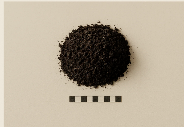
PLATE 01 · FIG. I · TOPSOIL SPECIMEN · 5 CM SCALE · CREAM-PAPER STUDIO