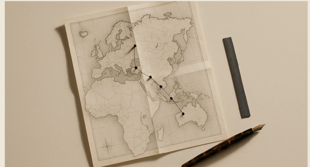
PLATE 05 · FIG. V · CONTINENTAL MAP · PINNED WAYPOINTS · SCALE · THE TRAJECTORY SPECIMEN

Forward-looking — indicative only. Wholesale investors only (Corporations Act s708(8)/(11)). Capital is at risk; past performance is not indicative of future results (RG 170). Read the Information Memorandum.