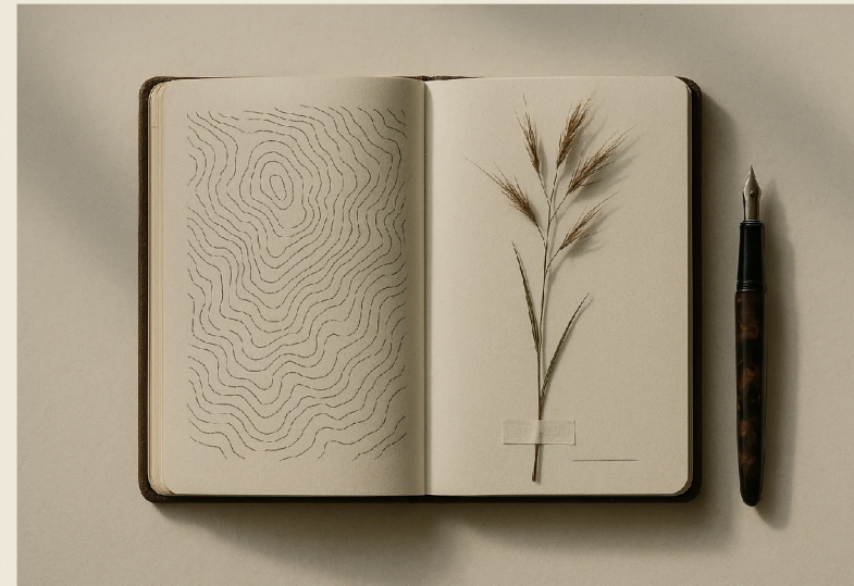
PLATE 08 · FIG. VIII · CARTOGRAPHY & HERBARIUM · THE COMMONS

"The commons is what we own together; ownership is impossible alone." — Wendell Berry, The Unsettling of America (1977). Forward-looking — indicative only. Wholesale investors only (Corporations Act s708(8)/(11)). Capital is at risk; past performance is not indicative of future results