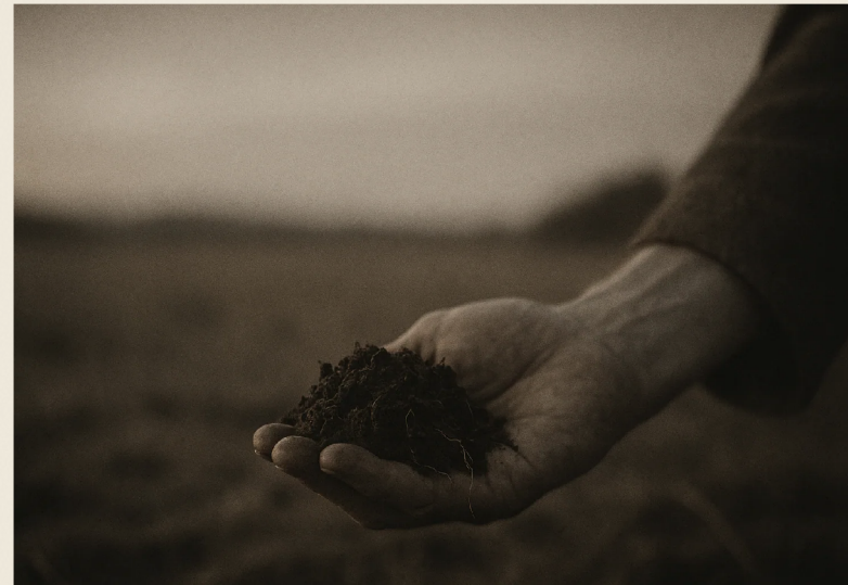
PLATE 06 · FIG. VI · HAND · SOIL · THE AUDIT OBJECT

NPV at ten years, post-audit · A$22.4 M. Forward-looking — indicative only. Wholesale investors only (Corporations Act s708(8)/(11)). Capital is at risk; past performance is not indicative of future results (RG 170). Read the